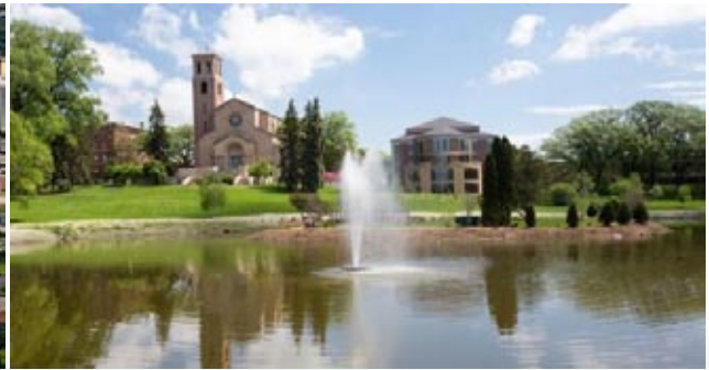
St. Catherine University