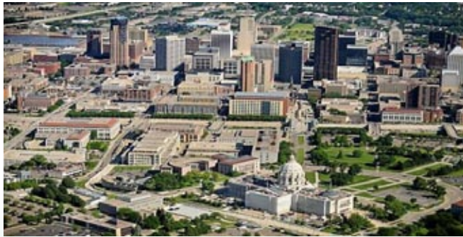
St. Paul and Minnesota Capitol

at St. Catherine University in St. Paul, Minnesota