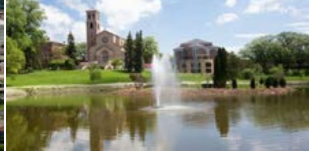
St. Paul and Minnesota Capitol