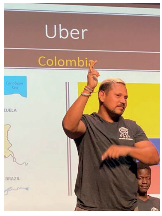
ELDA / 11