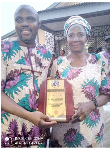
March 30th -5th April 2021- Leaving for the National Easter Camp in Illorin. An award plague was given to me for my long faithfulness in the service by CMDC at the camp.