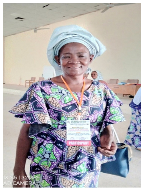
6th April-12th 2021, I attended the National Deaf Women conference in the capacity building. The theme: "Choose to challenge with focus on women in leadership achieving a squad future in a COVID 19 world"