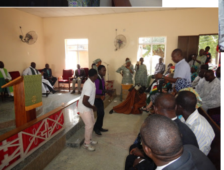
Special Dance Presentation by two of the church members. They had their own videographer. I did not get a photo of the church choir I only shot video.

Ringing the bell to start the service. This is an exact replica of the bell at the Lutheran Deaf Church in Copenhagen Denmark. It is rung three times at the start of a service. In the name of the Father, Son and Holy Spirit.