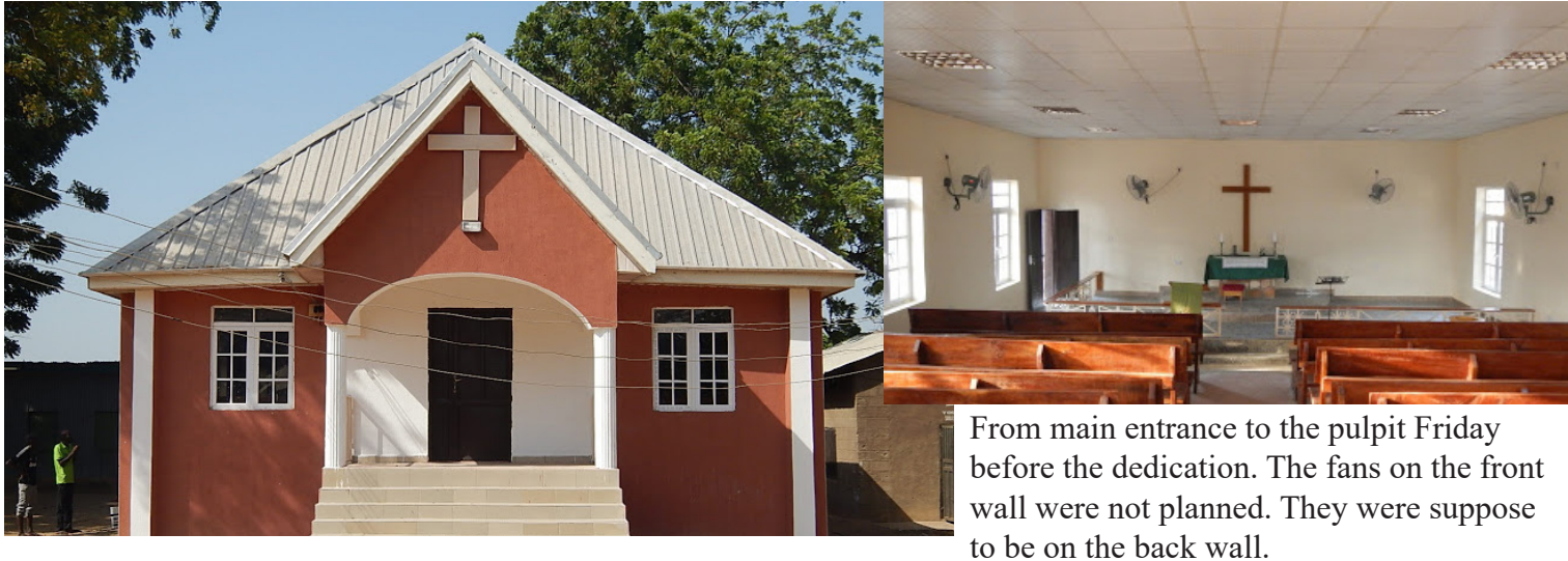
Front of Church Friday before dedication

These are pictures from the dedication of the church for the Deaf in Nigeria on November 13, 2016.