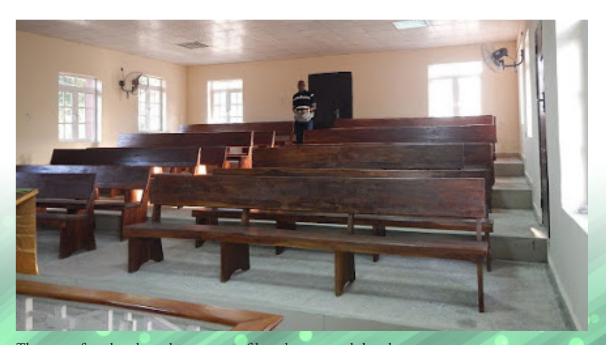
There are four levels and two rows of benches on each level.