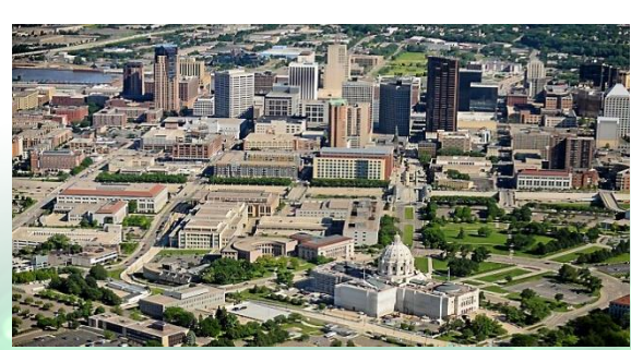
St. Paul and Minnesota Capitol