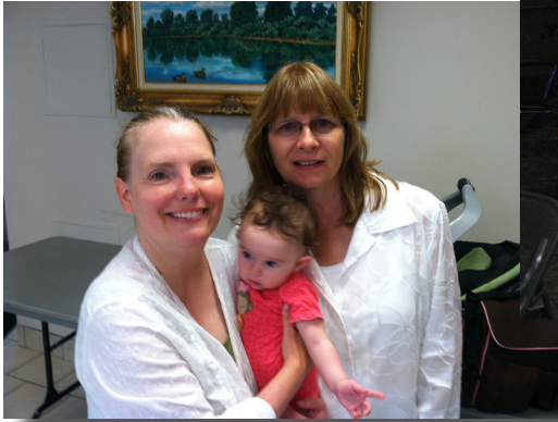
Fun times with friends