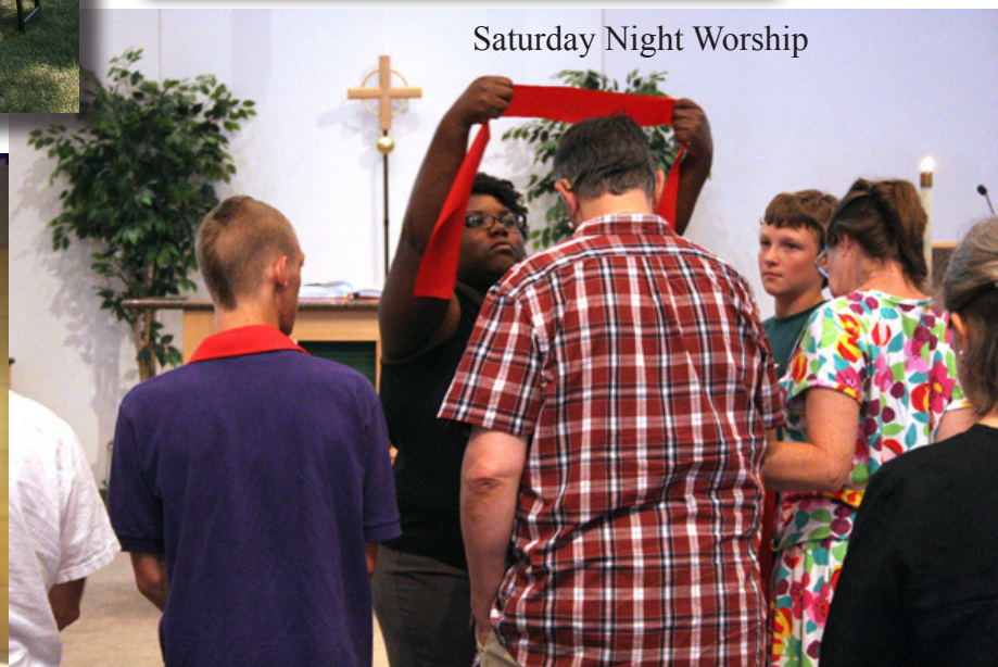
Saturday Night Worship