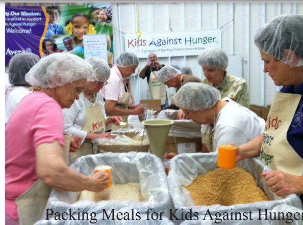
Packing Meals for Kids Against Hunger