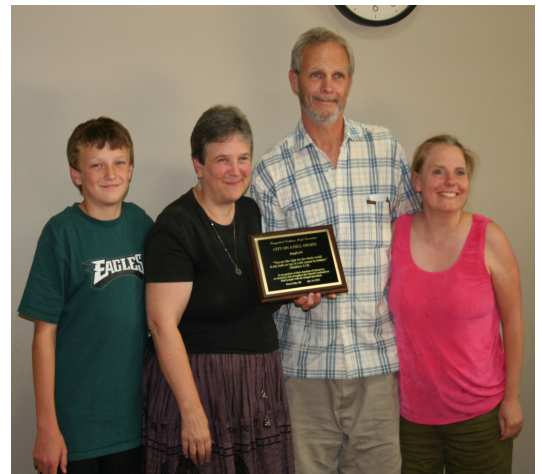
City on a Hill Award Winner: DEAF Can