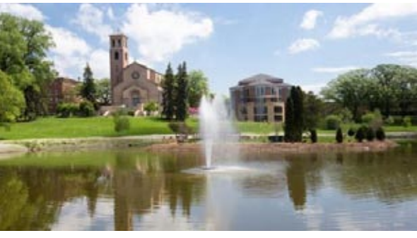
St. Catherine University