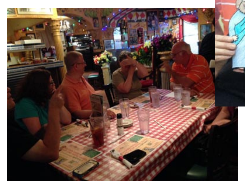
The ELDA taking Jesus with them wherever they go.