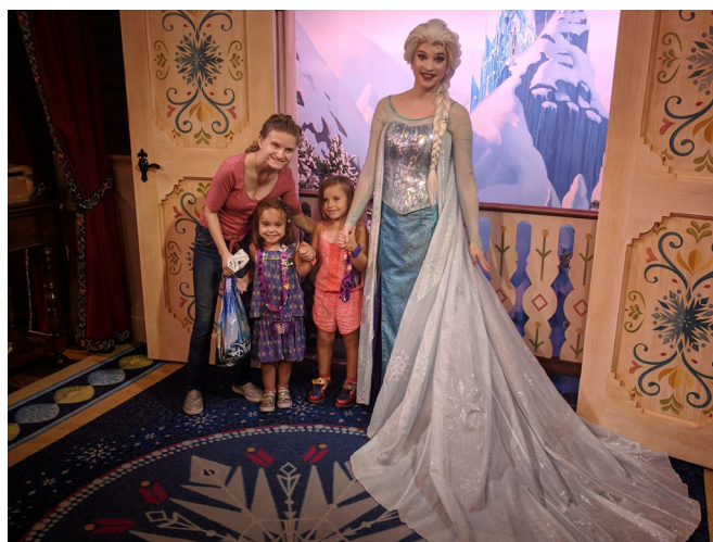
PICTURED ABOVE ARE OUR THREE DAUGHTERS AT DISNEY WORLD.

Fast forward 15 years later, my husband and I decided to consider fostering. So we expressed interest in fostering to the appropriate agency in our county and had an interview. The next day, they called us back and asked if we would be interested in adopting instead of fostering. They were seeking a family who could sign! Shortly after that, we brought home two additional beautiful girls. Amazing and forever grateful how God aligns everything in His timing.