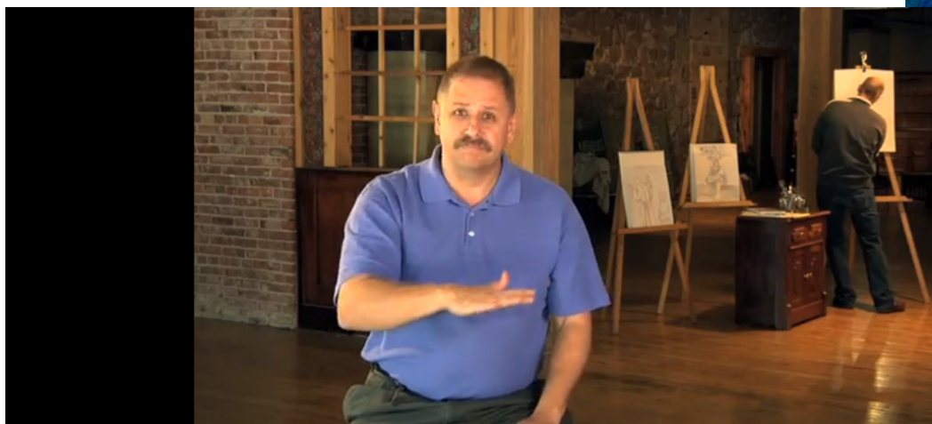
The First Christmas in ASL