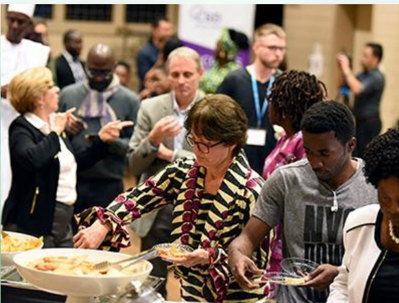
THE CONTINGENT WAS TREATED TO A PAN-AFRICAN DINNER, HELD ON NOVEMBER 2 AT PEIKOFF ALUMNI HOUSE ("OLE JIM").