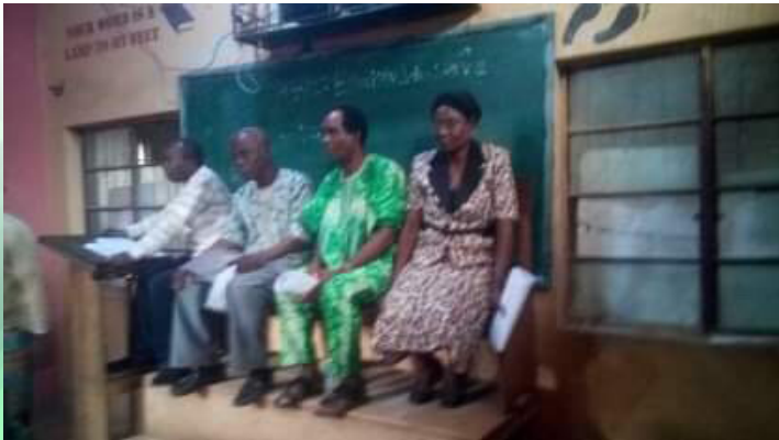
A GATHERING AT THE EVANGELISM CHRISTIAN TRAINING CONFERENCE IN IBADAN