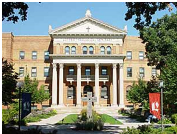
LUTHER SEMINARY IN ST. PAUL, MN.